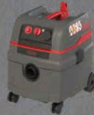
Related Product: Vacuum Cleaner DS25L 305-00371-000-001