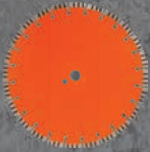
Ø 405 Diamond Saw Blade(Ø25,4) 305-00036-000-063