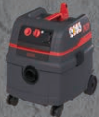
Related Product: Vacuum Cleaner DS25L 305-00371-000-001