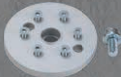
HY Pattern Flush Cutting Kit- 1" arbor 6-bolt (60mm bolt hole circle) 0299-0213-0000-001