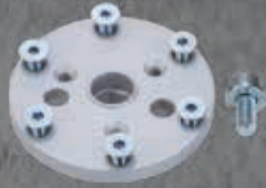
HV Pattern Flush Cutting Kit- 1" arbor Longyear 6-bolt (3 1/2" (88,9mm) bolt hole circle) & 3 bolt combined 0299-0213-0000-002