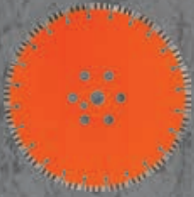
Ø 405 Flush Cutting Saw Blade (Fits HV Pattern Flush Cutting Kit) 305-00036-000-067

FLUSH CUTTING Detachable blade guard with toggle latches for flush cutting (WITH- OPTIONAL FLANGE)