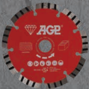
Universal: 150mm Diamond Saw Blade 150 x H10 x T2,6 x 22,23mm 305-00036-000-068