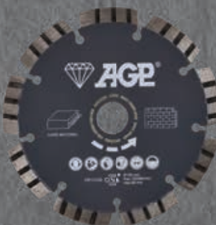
Hard Material: 150mm Diamond Saw Blade 150 x H10 x T2,6 x 22,23mm 305-00036-000-069

Optional quick set-up Guide Rail System provides maximum operator convenience and minimizes human error.