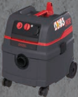
Vacuum Cleaner DS25L 305-00371-000-001