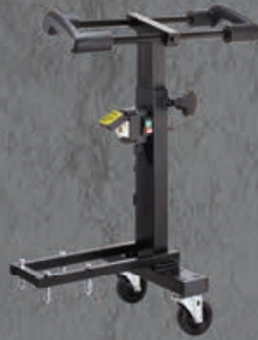
Floor Grinding Trolley