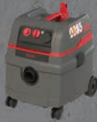
Related Product: Vacuum Cleaner DS25L 305-00371-000-001

Tool free rotating cover for edge grinding