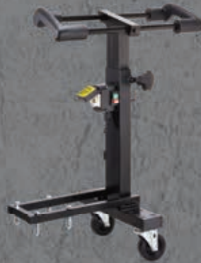
Floor Grinding Trolley