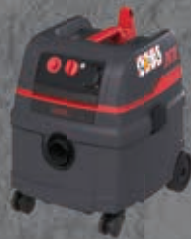
Related Product: Vacuum Cleaner DS25L 305-00371-000-001

Tool free detachable cover with magnet for edge grinding